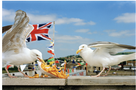
Martin Parr "I think the ordinary is a very under-exploited aspect of our lives because it is so familiar."

Welcome to your Photography A-level course summer guide. We are delighted that you have chosen to study with us! To ensure that you are able to make the best start on your photography course please read this booklet carefully and complete the "Rules" task described here. If you have any questions please email: richarday@richuish.ac.uk and I will get back to you as quickly as possible.