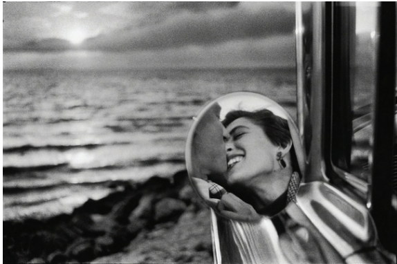
Elliot Ervitt "Photography is simply the function of noticing things."